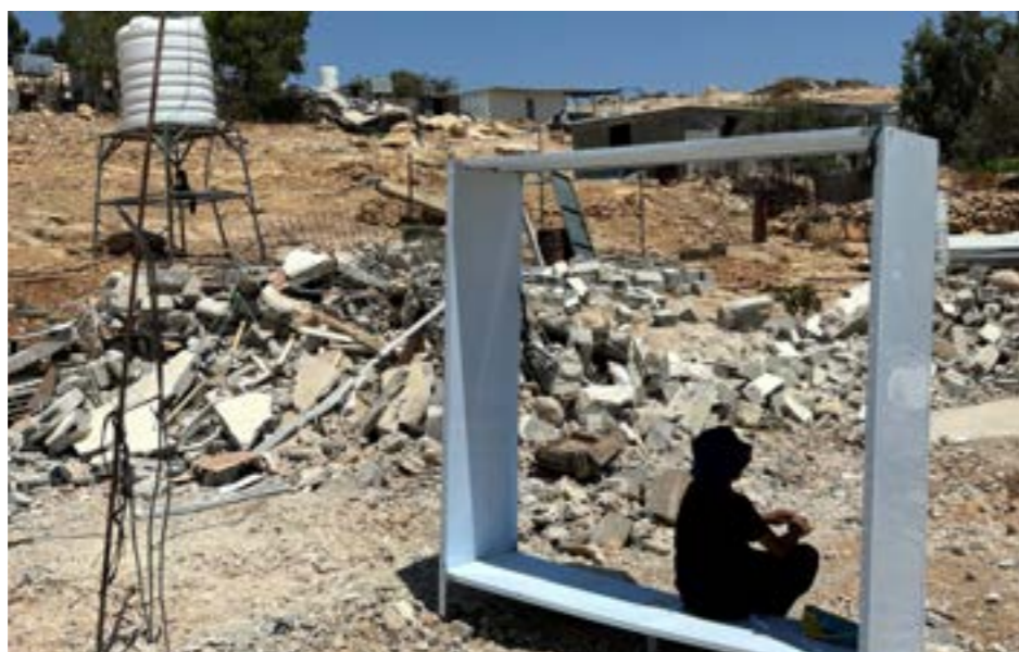
Palestinian teenager finding shelter from the sun after his home was suddenly demolished without warning in Umm al Kheir, Masafer Yatta, West Bank, Occupied Palestinian Territories.

In situations of occupation, both IHL and international human rights law (IHRL) apply. Under a human rights framework, freedom of movement may only be restricted in exceptional circumstances to protect national security, public order, public health or morals and the rights and freedoms of others (Article 12(3) of the International Covenant on Civil and Political Rights). However, restrictions on freedom of movement must be strictly necessary, proportionate and be the least intrusive measure possible to achieve the desired result. 33