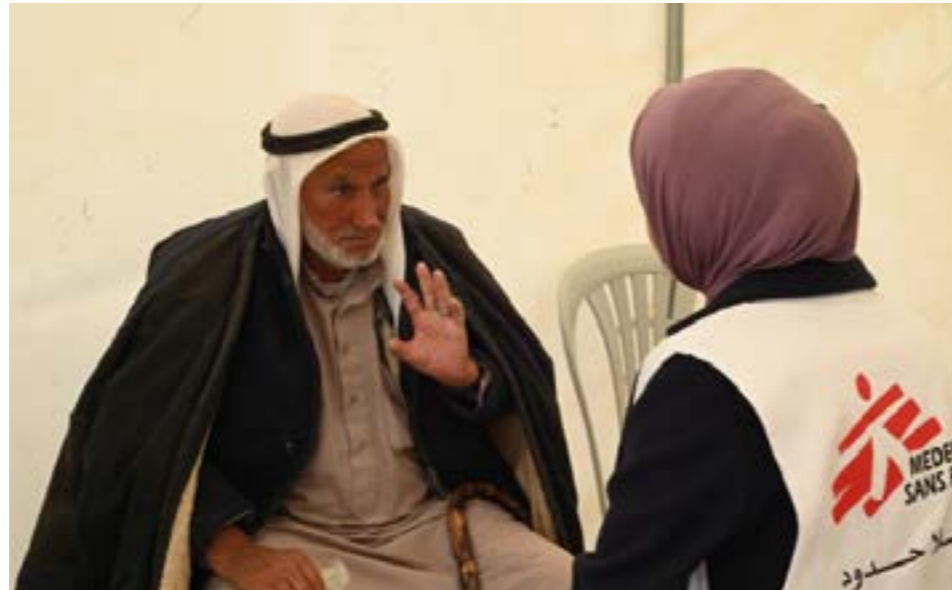
An MSF staff member speaks to a 70-year-old beneficiary from Al-Majaz community in Masafer Yatta, West Bank, Occupied Palestinian Territories.

The first month after 7 October was especially violent, which was reflected in the increase in mental health support needed. Up to 149 Palestinians who had experienced violence by Israeli soldiers and/or settlers required psychological first aid from MSF—compared to 78 during the previous month, a 91% increase. As of 7 March 2024, MSF’s mental health team in Hebron has provided counselling and psychotherapy sessions to 125 new survivors of violence by Israeli forces and/or settlers since 7 October, including 54 women and 40 children, some as young as three, four, and five years old. An additional 321 Palestinians (including 29 children and 158 women) who were affected by violence by Israeli forces and/or settlers received psychological first aid from MSF. Of those, 292 were affected by violence by the Israeli forces (91%), 10 by Israeli settlers (3%), and 19 by Israeli forces and settlers (6%). The vast majority, 226 patients, exhibited symptoms of anxiety after experiencing a home incursion.