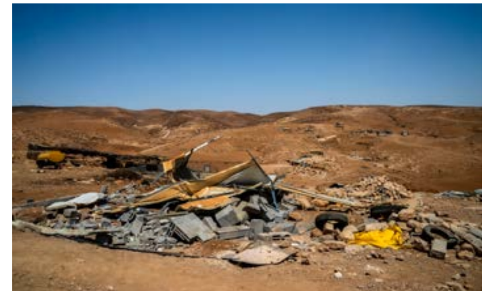
Demolished home of Palestinian community in Mirkez, Masafer Yatta, West Bank, Occupied Palestinian Territories.

After being displaced from their home and village, often people return to, hoping to retrieve the personal belongings they left behind in their sudden flight. Unfortunately, those MSF spoke to generally reported finding their homes demolished and tents burned, including their clothes, furniture, and food. Dishearteningly, families continue to feel unsafe and at risk of forced displacement in the locations they were displaced to as they do not have their own home, continue to face movement restrictions impacting their access to services, continue to be targeted with settler attacks, and are told by Israeli forces they need to move four or five kilometres because they are too close to a military zone.