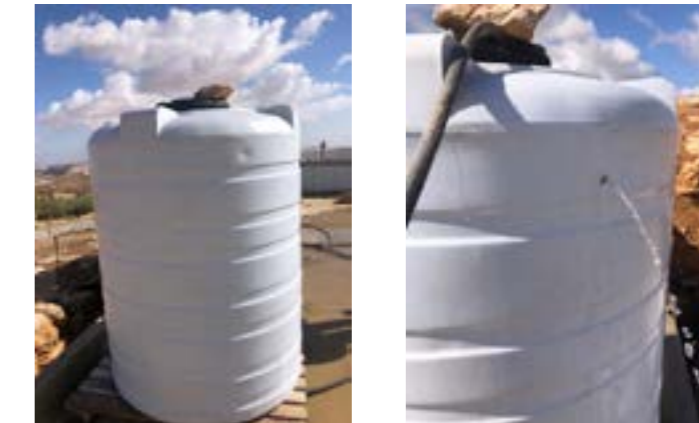
Water tanks with bullet holes, caused by settlers shooting at homes, herd, and water tanks, according to the community.

As reflected in the data on the escalating violence in the West bank (Table 1) and supported by testimonies from MSF's patients, Palestinians in Hebron Governorate—men, women, children, and elderly—are exposed to more frequent and intense physical violence, have reduced access to medical care, are forced to change their health-seeking behaviours. They are left no choice but to adapt their diet due to financial hardship, and have reduced access to potable water—all factors that are known to negatively impact physical health.