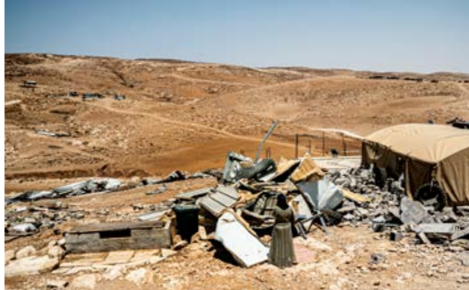
Demolished shelter in Masafer Yatta, West Bank, Occupied Palestinian Territories.

According to UN Office for the Coordination of Humanitarian Affairs (OCHA), of the injuries recorded across the West Bank since 7 October, 33% of those have been caused by live ammunition, compared with 9% in the first nine months of 2023, indicating a stark shift in tactics. 26 MSF patients in H2 shared stories of soldiers shooting with live ammunition at young men and houses as well. One patient reported, “they aim weapons at us immediately as we open the house door.” Another patient shared, “there was a young man crossing the road, so the soldiers attacked him, and when my nephew went to defend him, the soldiers tried to shoot my nephew.”