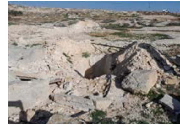
The community's water well demolished by Israeli settlers under the 'protection' of Israeli forces, according to the community.